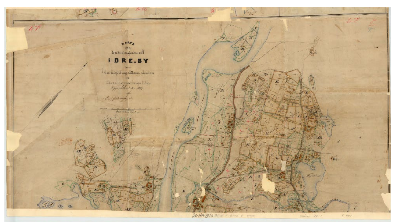
Map of Idre village, 1882

All previous maps are published on IOF Eventor